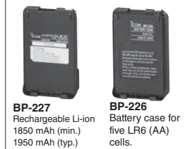
BP-227 Rechargeable Li-ion 1850 mAh (min.) 1950 mAh (typ.) BP-226 Battery case for five LR6 (AA) cells.