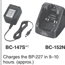
BC-147S*1 BC-152N Charges the BP-227 in 9–10 hours. (approx.)