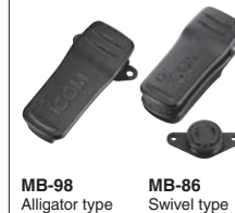
MB-98 MB-86 Alligator type Swivel type