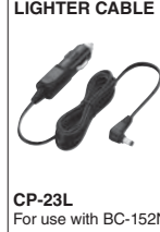
CP-23L For use with BC-152N