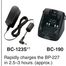
BC-123S*1 BC-190 Rapidly charges the BP-227 in 2.5–3 hours. (approx.)