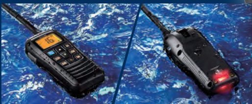
Float'n Flash function (front/back)

The radio floats with a flashing LED light to help you retrieve it from the water.